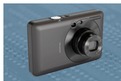
Digital Still Cameras