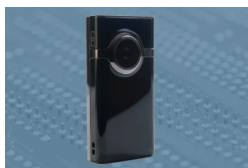
Digital Video Cameras